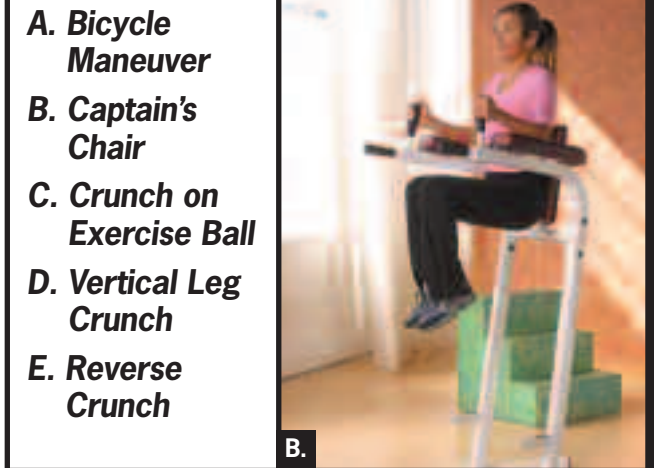
A. Bicycle Maneuver B. Captain's Chair C. Crunch on Exercise Ball D. Vertical Leg Crunch E. Reverse Crunch